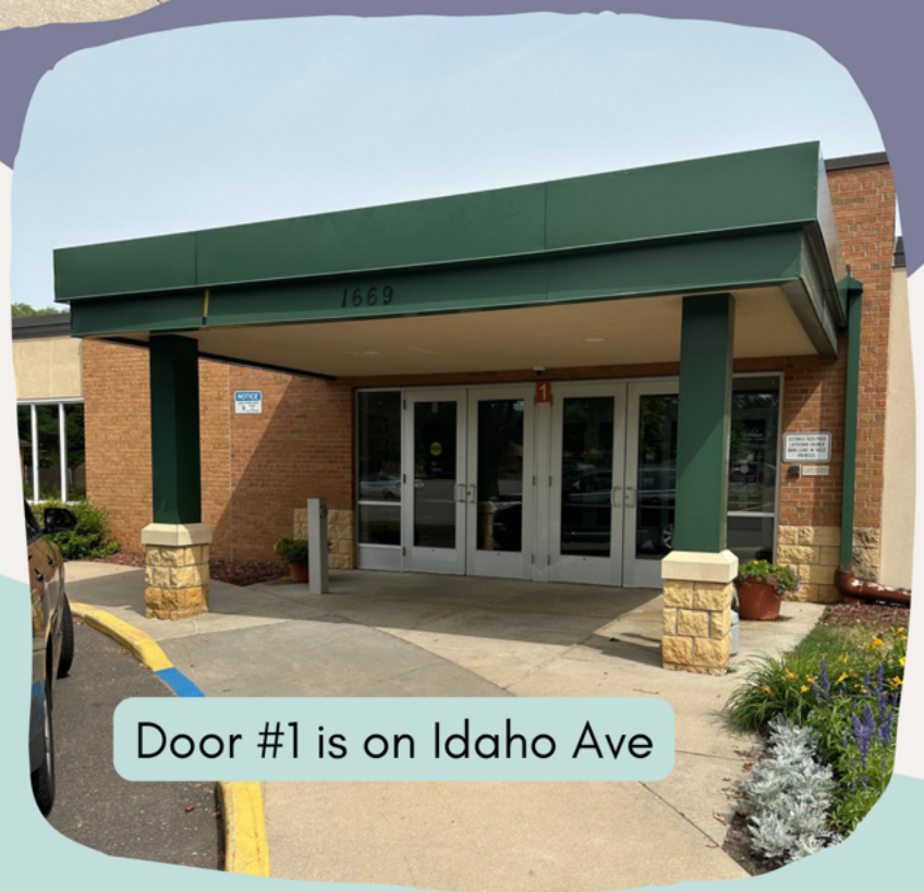
Door #1 is on Idaho Ave

There are two entrances to the building. All entrances lead to the main lobby.