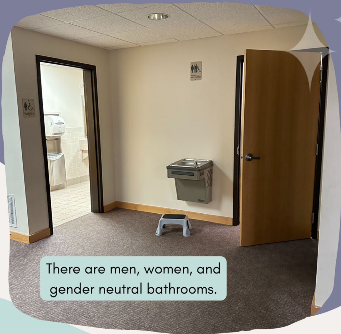
There are men, women, and gender neutral bathrooms.

If I need to use the bathroom, there are bathrooms near Luther Hall.