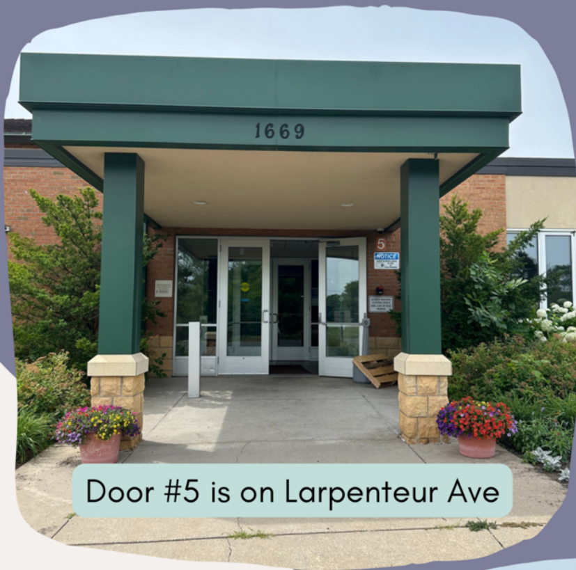
Door #5 is on Larpenteur Ave